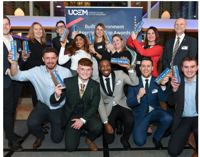
Built Environment Apprenticeship Awards winners

Whilst we are seeing a slight downturn in the market, we still achieved our overall target number of new students for the year, the majority of which were once again apprenticeship students. We plan to launch a series of new programmes from September 2024 that will support our breadth and growth ambitions. The new programmes we have planned for September include a Level 7 Sustainability Business Specialist apprenticeship, a BSc in Architectural Design Technology, an MSc in Urban Planning and a Chartered Surveyor Degree Apprenticeship - Planning and Development Pathway.