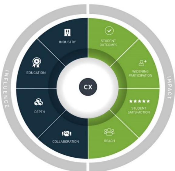
Figure 1: UCEM Institutional Strategy Overview 2019/25

‘to provide truly accessible, relevant and cost-effective education, enabling students to enhance careers, increase professionalism and contribute to a sustainable built environment’.