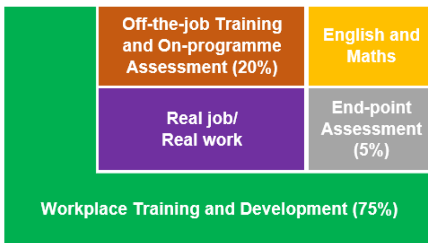
Figure 1 Key components of an apprenticeship

At the core of any apprenticeship there must be a real job with real work activity that relates to the occupation and enables the development of the required knowledge, skills and behaviours. Without this an apprenticeship will not have a positive outcome. As shown in Figure 1, approximately 75% of an apprenticeship is allocated to workplace training and development. A minimum of 20% is allocated to off-the-job training and on-programme assessment.