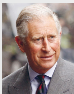
Our Patron, His Royal Highness, The Prince of Wales