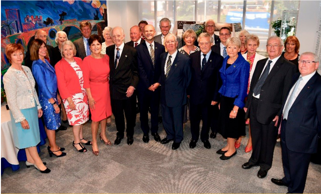
Past Chairs, Principals, Honorary Treasurers and Secretaries attending the luncheon held in their honour.

► The key men and women, comprising more than 90 years' service between them to date, having driven the institution's forward trajectory over the past half-century, were joined by their partners for the meal at UCEM's Reading-based Horizons HQ.