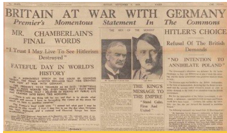
Newspaper front page from the day war was announced

“The Summer Term of 1939 passed without incident, although against a background of mounting international tension. Every provision had been made for an Autumn Term which should include more classes and provide for a greater number of students than ever before. The term was due to commence on September 4. On September 3 War was declared.”