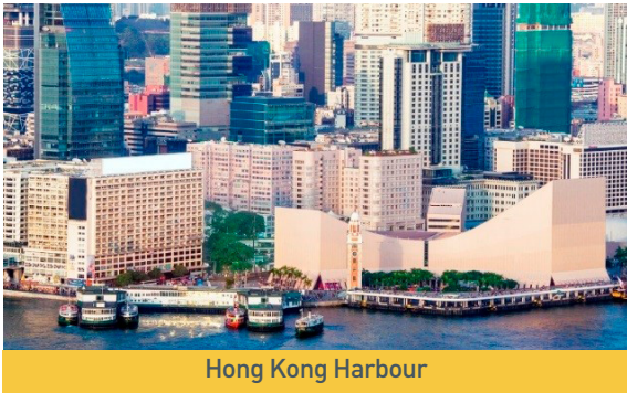
Hong Kong Harbour