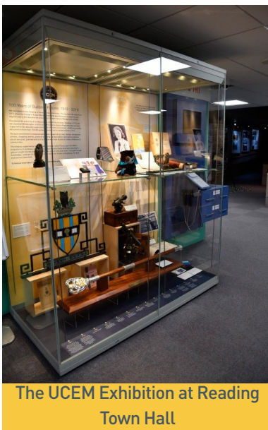
The UCEM Exhibition at Reading Town Hall