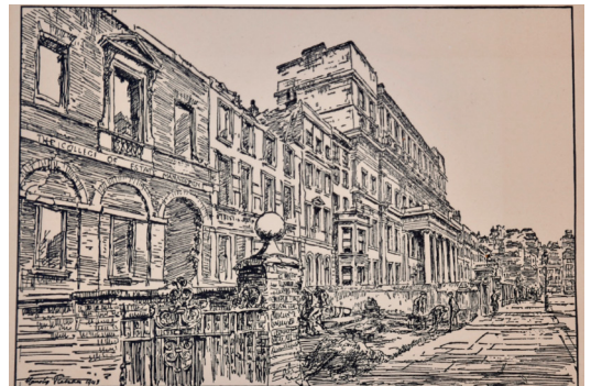
A sketch of Lincoln’s Inn Fields after the bombing

In addition, “the Secretary was instructed to enquire if there were any facilities for British prisoners of war to continue their professional studies”.