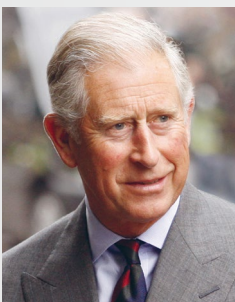
Our Patron, His Royal Highness, The Prince of Wales