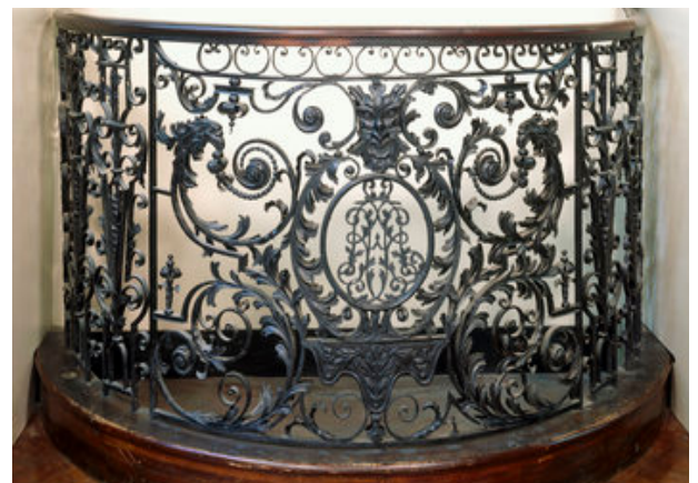
Wrought iron baluster from 35 Lincoln's Inn Fields, London, which was destroyed by an incendiary device in 1941

To this day, it can be viewed in room 54 of the Victoria and Albert Museum in Kensington.