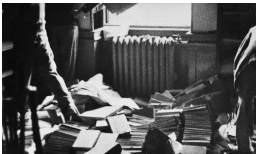
Picking up books from the rubble following the Blitzkrieg attack on Lincoln's Inn Fields

In 1923, HRH Prince of Wales attended CEM's Inauguration Ceremony, commencing a century of royal associations.