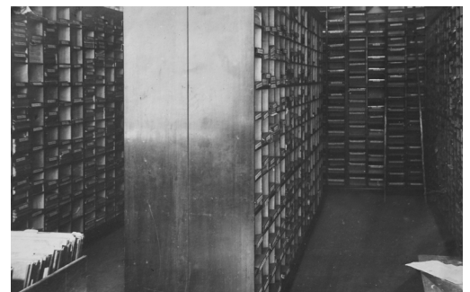
The Postal Department at Lincoln's Inn Fields