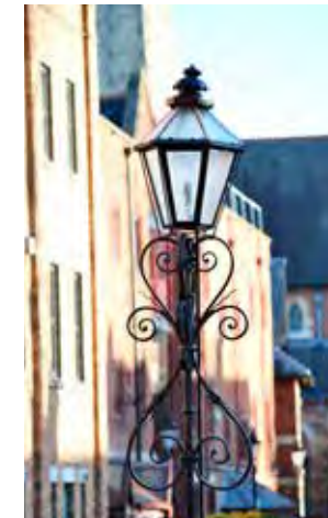
The UCEM lamp

🏠 A lamp from one of the institution's early premises, St Alban's Grove, is fixed into position at UCEM's Horizons office on the outdoor decking. The institution moved into St Alban's Grove after its original home at Lincoln's Inn Fields was bombed during the Second World War, and the lamp also found residence at the University of Reading when CEM was located there.