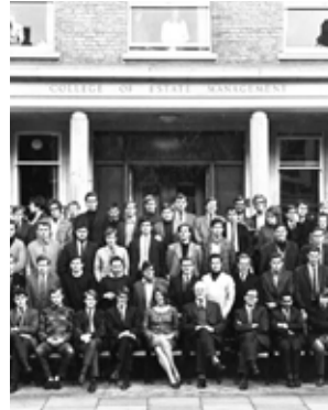
CEM staff members outside St Alban's Grove.

The arrangement between the two institutions saw CEM's full-time students become part of the University of Reading whilst correspondence students remained part of the College.