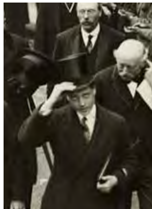
The then Prince of Wales (who later became King Edward VIII) after unveiling a bronze tablet to mark the granting of CEM's Royal Charter in 1923.

Following the award of Taught Degree Awarding Powers in 2013 and the achievement of University College title in 2015, University College of Estate Management (UCEM) left the University of Reading campus as an independent institution, moving to its Horizons office in the centre of Reading in 2016.