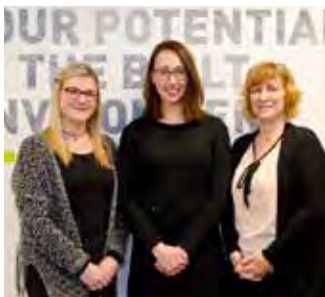
Student Registration Team

The team help answer any queries about examinations and results.