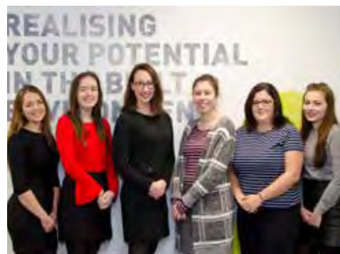
The Enquiries and Admissions Teams